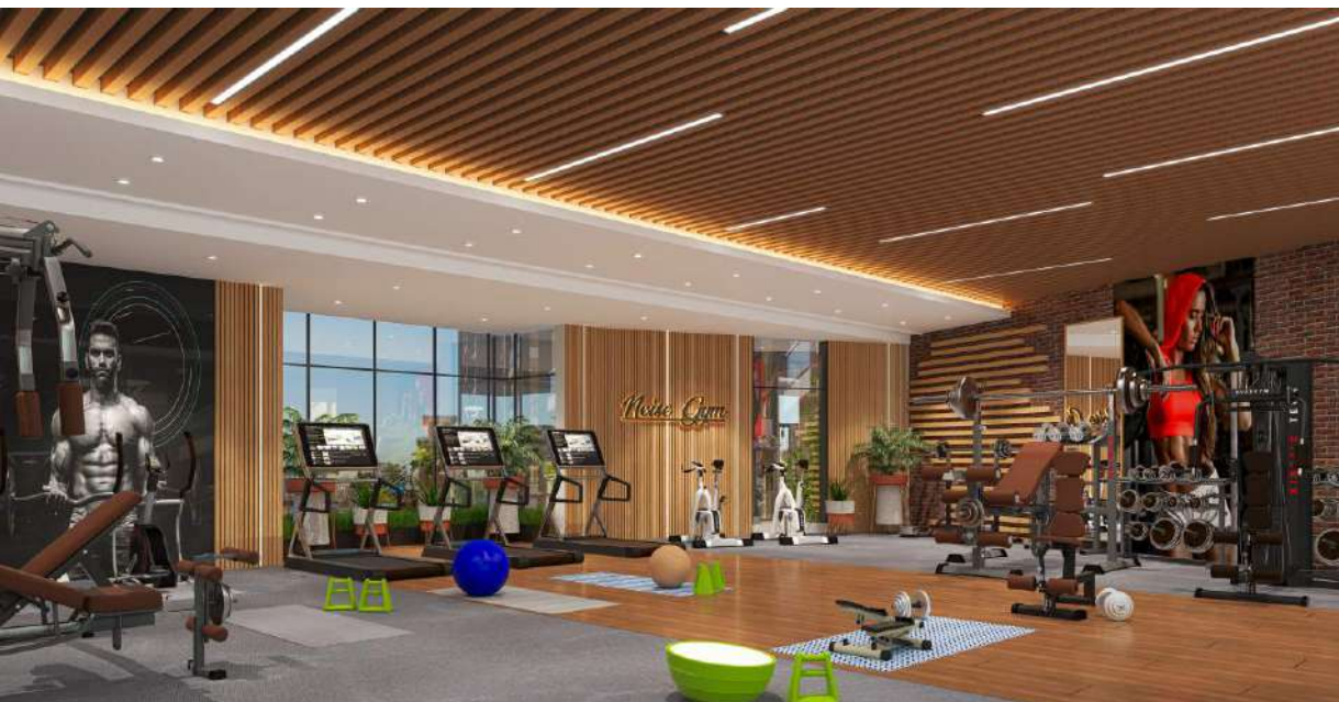
MODERN GYM & HEALTH CLUB