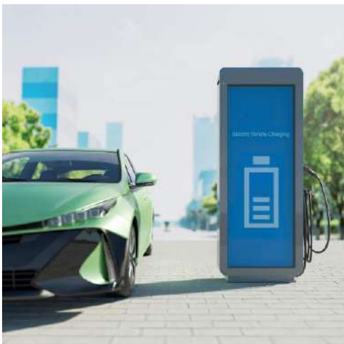
EV CAR CHARGING POINT

24/7 CCTV surveillance with Recording, Video Doors Phones in every flat Digital Smart Lock with fingerprint / pass code/ mobile access in each flat