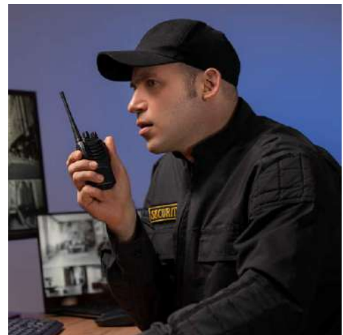
24X7 3-TIER SECURITY